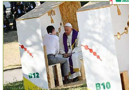
Pope Francis hears the confession of a World Youth Day pilgrim in Vasco da Gama Garden in Lisbon, Portugal, Aug. 4, 2023. The pope administered the sacrament to three pilgrims: young men from Italy and Spain, and a young woman from Guatemala.